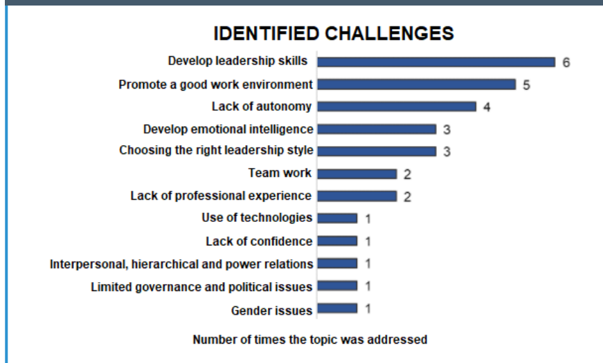
Figure 2. The main challenges for nurses in nursing leadership identified in the scientific literature.

The main factors mentioned as barriers to the development of leadership skills were: limited perspectives, 5 gender issues, 5,7 contractual and professional barriers, 5,7 hierarchical and organizational structure issues, 5,10 fast pace and sudden changes in the work environment, 6 lack of support from the institution 7,8,10 and professional inexperience and joviality. 8,10