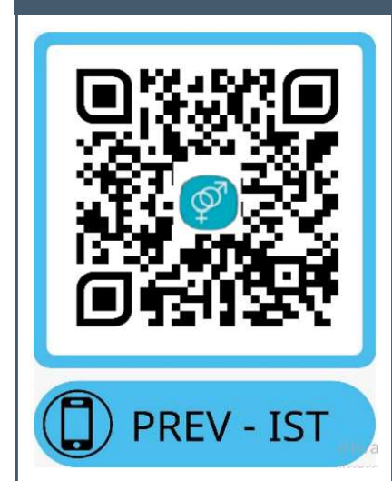
Figure 1: QR code to access the app.

At the beginning of the action, the students showed resistance to the practice of health education, considering that they would miss the physical activities offered by the teacher's class. However, after the introduction of the theme, they seemed to show great interest, and the importance of the discussion on sexual health was debated, in which points such as STI pre-