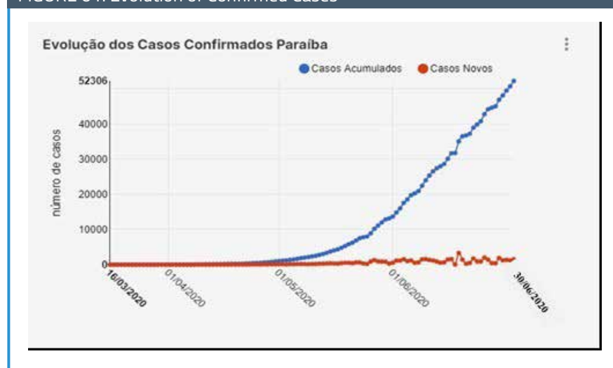
FIGURE 01: Evolution of Confirmed Cases

The Lethality Rate - LR in the State is 2,1%, until June 30th. In the municipalities involved in the study, an LR of 2,5% is observed in the city of João Pessoa, Campina Grande with 1,4%, Guarabira with 0,9%, Cabedelo with 0,6%, with the lowest lethality rate among said municipalities in Paraíba. Santa Rita has a lethality rate higher than the national rate, expressing 7,7% of LR, Patos has an LR of 5,0%, Mamanguape of 1,1%, Pedras de Fogo of 1,4%, Bayeux of 6,3% and Caaporã of 1.2%.